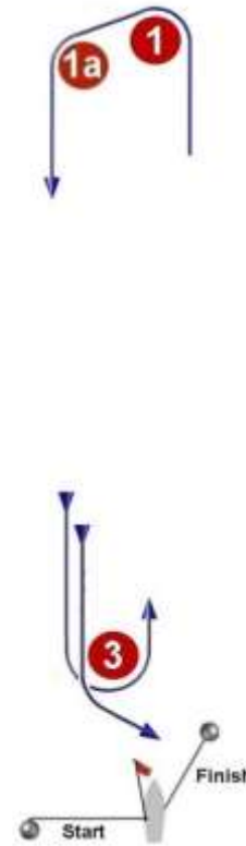
Course L: Windward/Leeward Course

T 3 Start - 1 - 2 - 3 - 1 - 3 - 1 - 2 - 3 - Finish